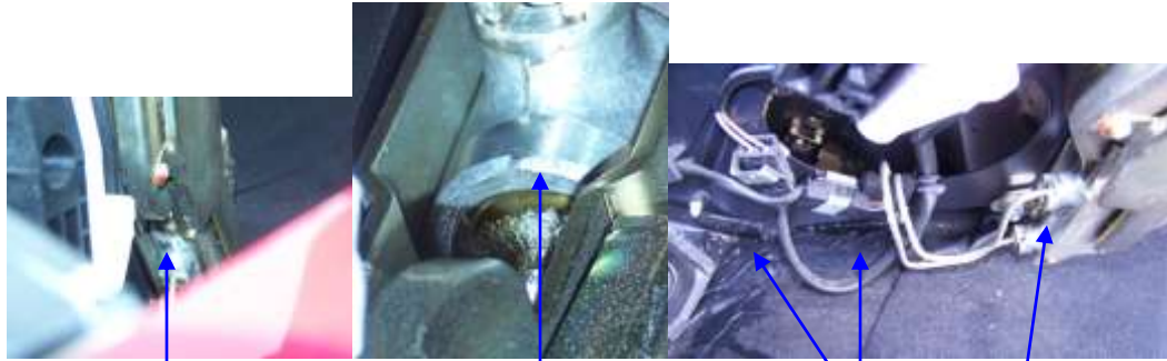
(LH lock cylinder, leaking) (zooming in) (soft top well, oily, with lock cylinder)