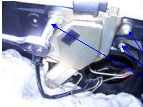
(Remove three 10-mm nuts)